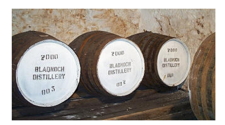
Casks of Bladnoch maturing at the distillery. Casks numbered 001,002 & 003 were the first three casks filled after Bladnoch Distillery went online again in November 2000. The casks were filled on 20th December 2000

Blackadder International and Invicta Import are delighted to announce they have been appointed importer and distributor for Bladnoch Single Malt Whisky in Sweden.